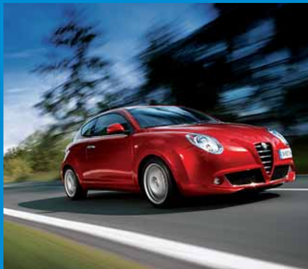
The Alfa MiTo – turned heads whilst on display at chq last month

On show were the Alfa 159, 159 Sportwagon, GT, Brera and Spider, as well as the sleek newest addition to the range, the sporty MiTo, which is due to launch in January.