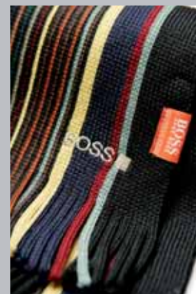
Hugo Boss woollen scarf, Louis Copeland, €89.50

Chateau Lynch-Bages, White 2006, Mitchell & Son, €52.50