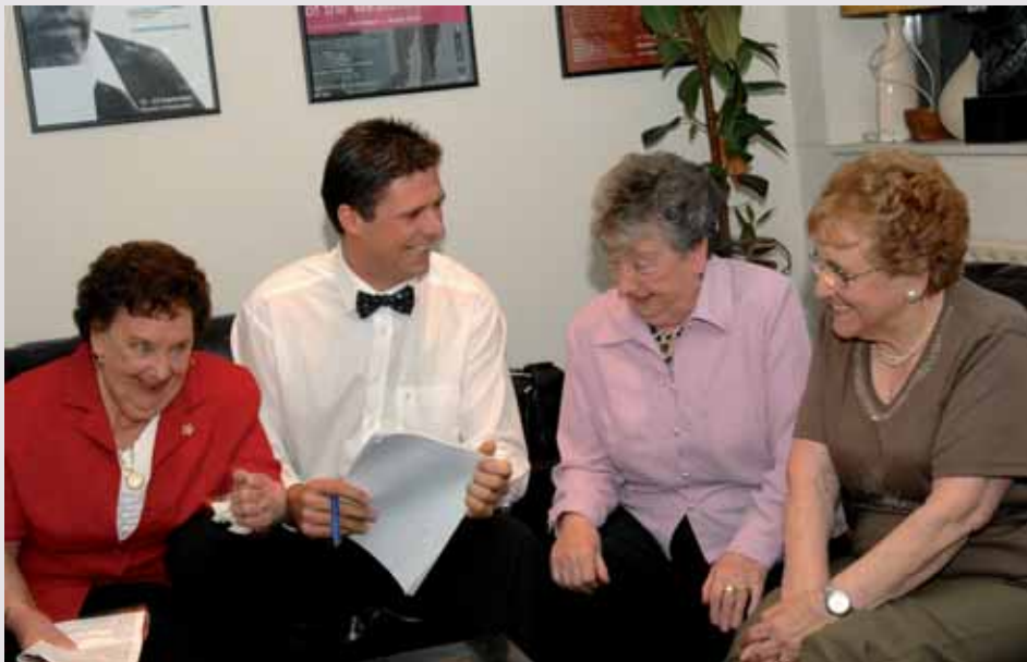
Niall Quinn chats to contestants prior to the Docklands Seniors Talent Showcase in the Abbey Theatre