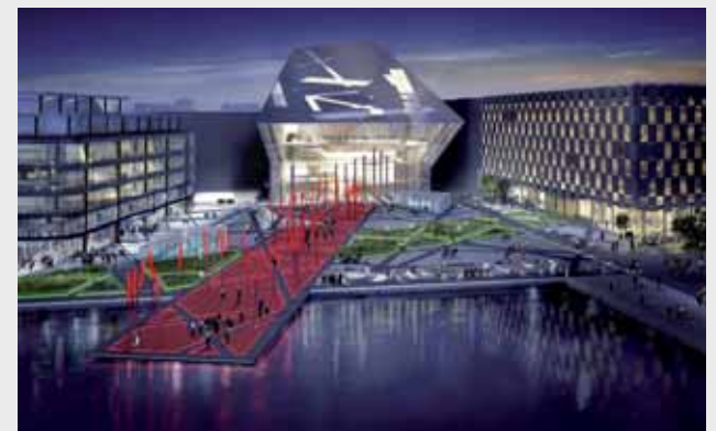
Docklands' architecture was celebrated during the recent Open House Dublin event organised by Architecture Ireland

Other new items included Open Space, an extended programme of walking tours; Children's Open House, consisting of architectural tours and workshops in the National Gallery of Ireland and the Hugh Lane Gallery; and a visual arts programme, Culturconstruction, where four artists were asked to create site-specific installations/performances to respond to the city's architecture.