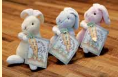
Dinky Wee Hop miniature plush bunnies, Bunnies by the Bay, €10

Mitchell & Son: claret 2006, €11.50; sauvignon blanc, €10.50