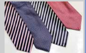
Stylish silk ties, Louis Copeland, €50

Riedel Glasses Set, Vinnum Extreme Cabernet, Mitchell & Son, €25