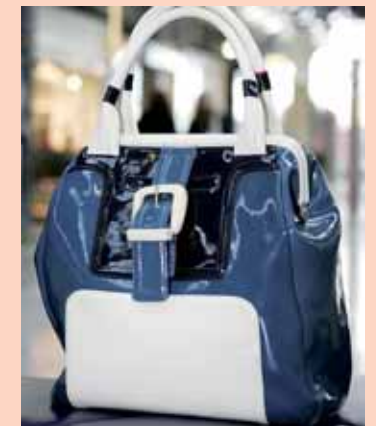
Blue patent leather Orla Kiely handbag, Kohl, €425