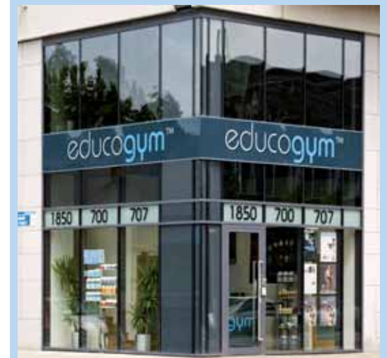
Educogym – pioneering a new approach to fitness

The educogym system is proven to show that the average person attains results which include an improved body composition, better metabolism and higher energy levels. For more information about Educogym's Corporate Wellness programme contact Joe O'Sullivan at 1850 700 707.