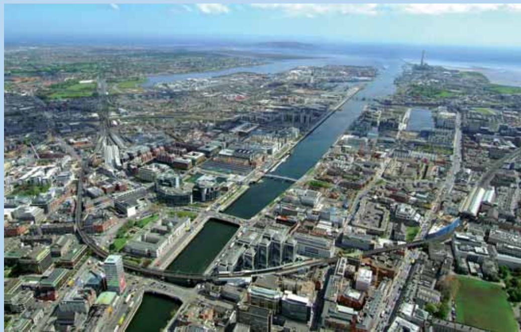
Dublin’s Docklands: its evolution over the next 10 years is mapped out in the new Master Plan

The 2008 Master Plan can be viewed on the Docklands Authority website, www.dublindocklands.ie . Copies are also available from the Authority’s offices, 52-55 Sir John Rogerson’s Quay, tel 818-3300.