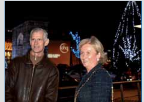
Paul Maloney, chief executive of the Docklands Authority, and Councillor Eibhlin Byrne, Lord Mayor of Dublin, at the switching-on ceremony

T he switching on of the Christmas lights signals the official start of the festive season in Docklands. Performing the honour this year was Councillor Eibhlin Byrne, Lord Mayor of Dublin who, with a flick of a switch, illuminated over 8,000 twinkling blue lights on 200 trees throughout the Docklands area, both north and south of the river.