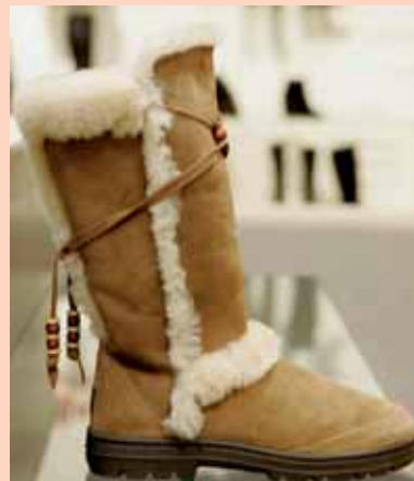
Ugg Boots in Nightfall, Fitzpatrick's, €365

Nicholas Kirkwood Blue Shoes, The Pink Room, €605