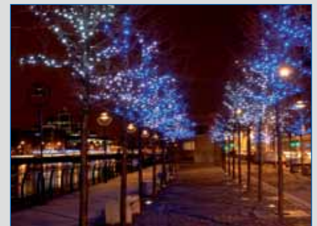
Lights on the campshires herald the arrival of Christmas

“This is only the second year that there has been an official Christmas lighting ceremony in Docklands so it is a particular privilege to be invited here this evening to do the honours.”