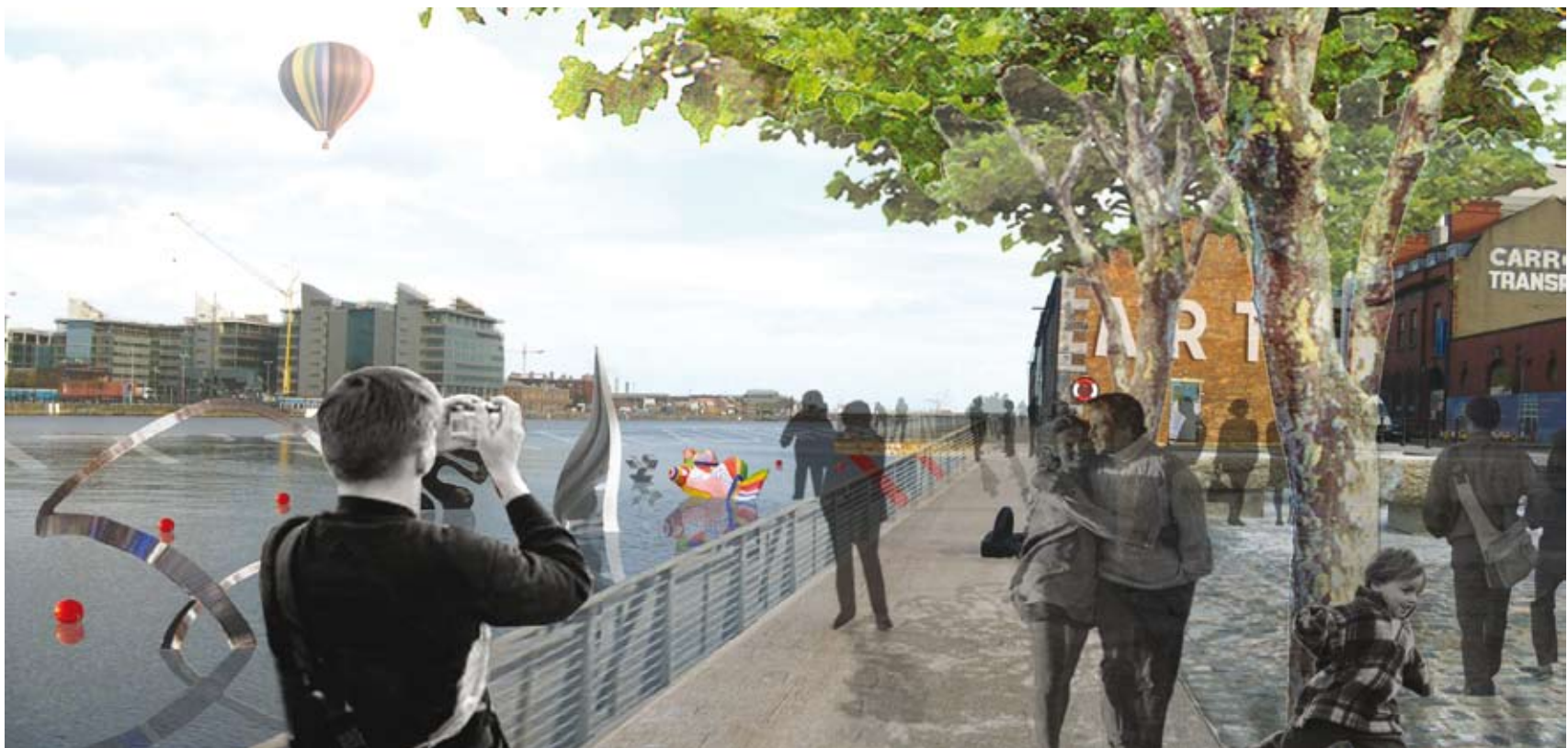
Animation of the campshire through temporary art installations