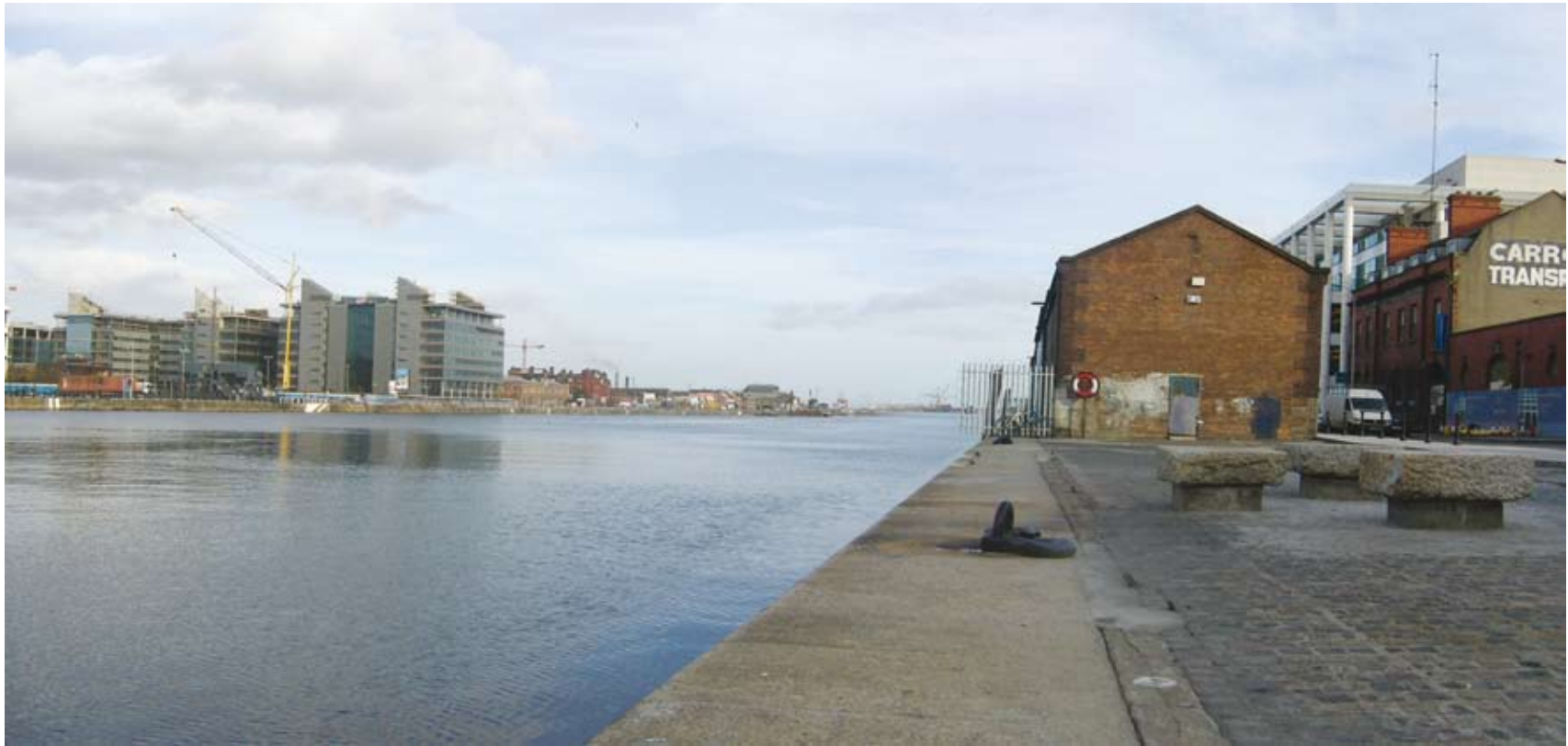
The BJ Marine warehouse on Sir John Rogerson's Quay - existing situation