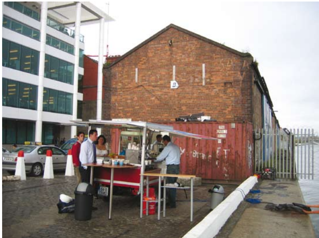
BJ Marine - ad hoc trading

The two BJ Marine warehouses on Sir John Rogerson's Quay have been empty for a long time waiting for new users or the sledgehammer. These two structures present a great opportunity to liven up the waterfront with a minimal investment in new buildings and outdoor space. To preserve the warehouses on the campshire it is necessary to create more space around the structures, as they block the flow of pedestrians and cyclists. A cantilevered terrace over the Liffey would give these warehouses the space they need, allowing enough space for movement.