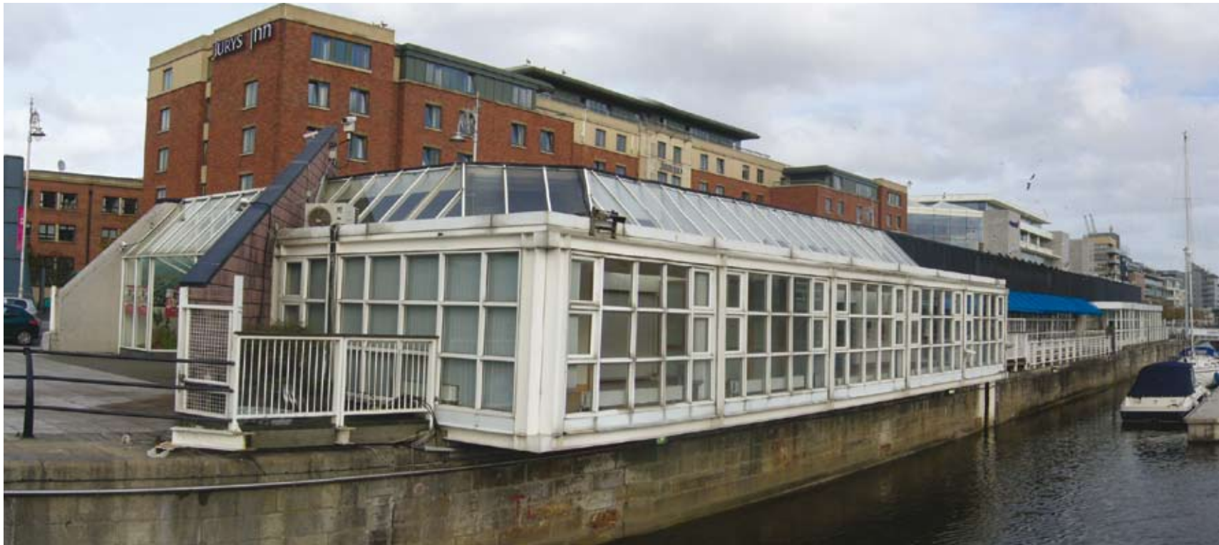
Custom House Quay - existing building